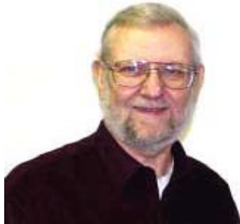
The Prez Sez: